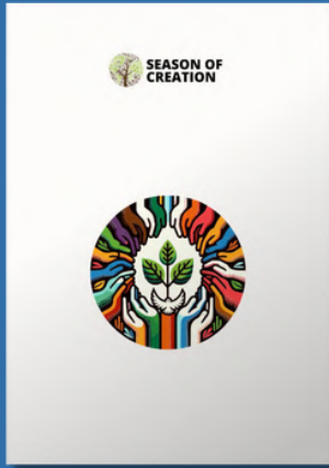
Season of Creation 2024 Advocacy Guide