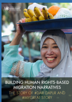
OHCHR Guide - Building Human Rights-Based Migration Narratives: the Story of #DariDapur and #MyGreatStory