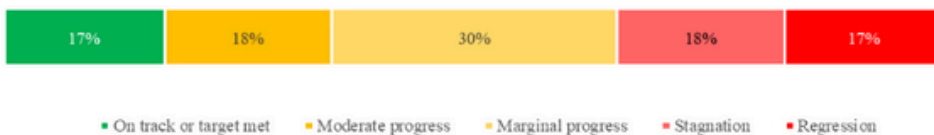
Figure 2. Progress assessment for the 17 Goals based on assessed targets, by Goal, (2015-2024 trend data)