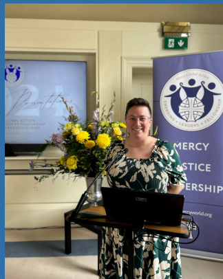
MELF Cohort 3 Research Presentations