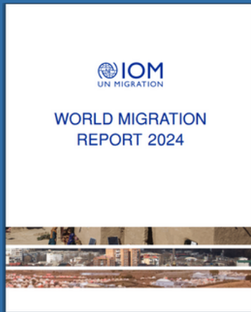
World Migration Report 2024 Interactive Page