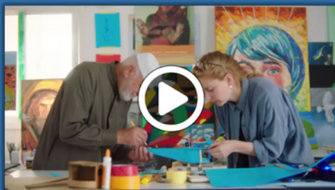
'We Were Here' UNHCR Documentary Series for World Refugee Day (scroll down)