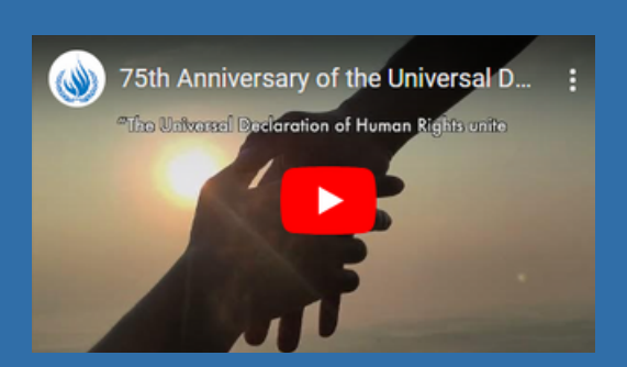
75th Anniversary of the Universal Declaration of Human Rights