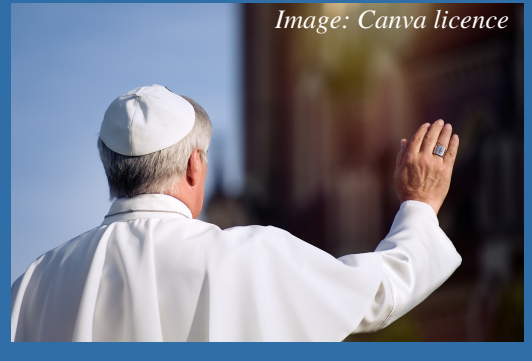
Address of Pope Francis to COP28

Webinar re: Israel & Palestine: 'Courage in the Unknown: Exploring New Possibilities' - American Friends of Combatants for Peace