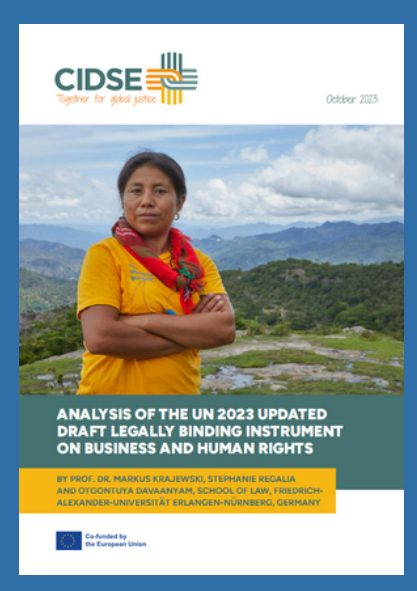
CIDSE: Analysis of the UN 2023 <u>Updated Draft Legally Binding</u> <u>Instrument on business & human rights</u>