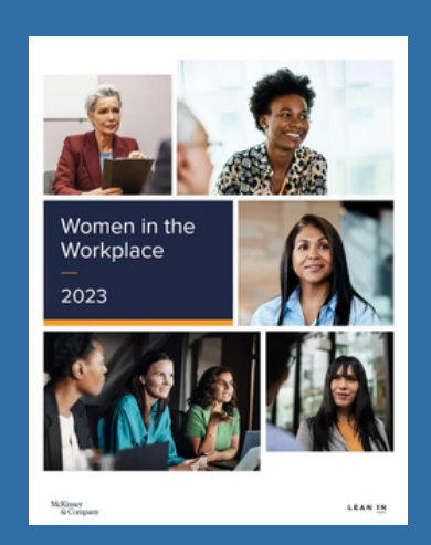
McKinsey & Company: Women in the Workplace 2023 Report