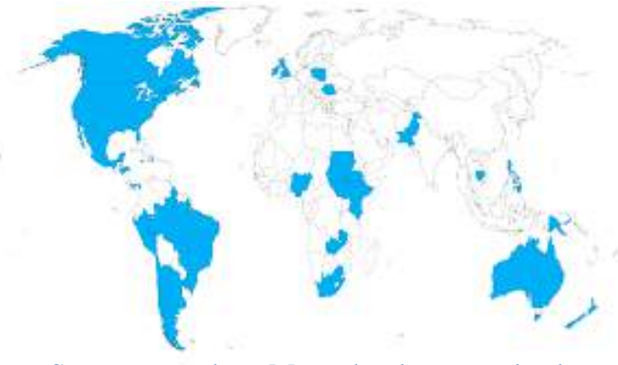
Some areas where Mercy has been involved in

As members of Mercy Global Action, we stand united in our shared commitment to social justice, sustainable living, and care for the Earth. The recent release of Voluntary National Reviews (VNRs) for countries in the Mercy world has provided an enlightening overview of progress towards the Sustainable Development Goals (SDGs). We will examine some of the key messages, with a focus on SDGs 5 (Gender Equality), 6 (Clean Water and Sanitation), and 11 (Sustainable Cities and Communities).